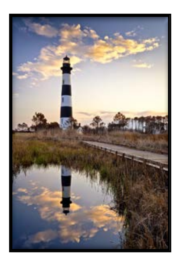
"...it is God who is at work in you, enabling you both to will and to work for his good pleasure" Philippians 2:13