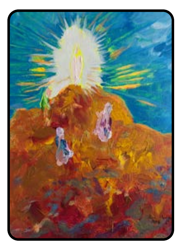
"And he was transfigured before them..."