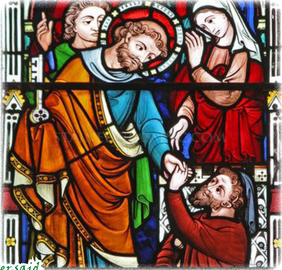
“St. Peter Healing the Lame” | StainedGlass.com

Then Peter said, “Silver or gold I do not have, but what I do have I give you. In the name of Jesus Christ of Nazareth, walk.”