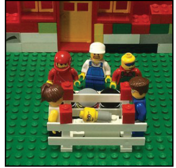
A Lego Epiphany: “ Lego Magi visit the infant Jesus ” as built by children during the Holy Moly program Wednesday evening.

The Women of Peoples Church are accepting donations for their next Jewelry & More Sale. Donations are tax deductible and can be dropped off at the church office.